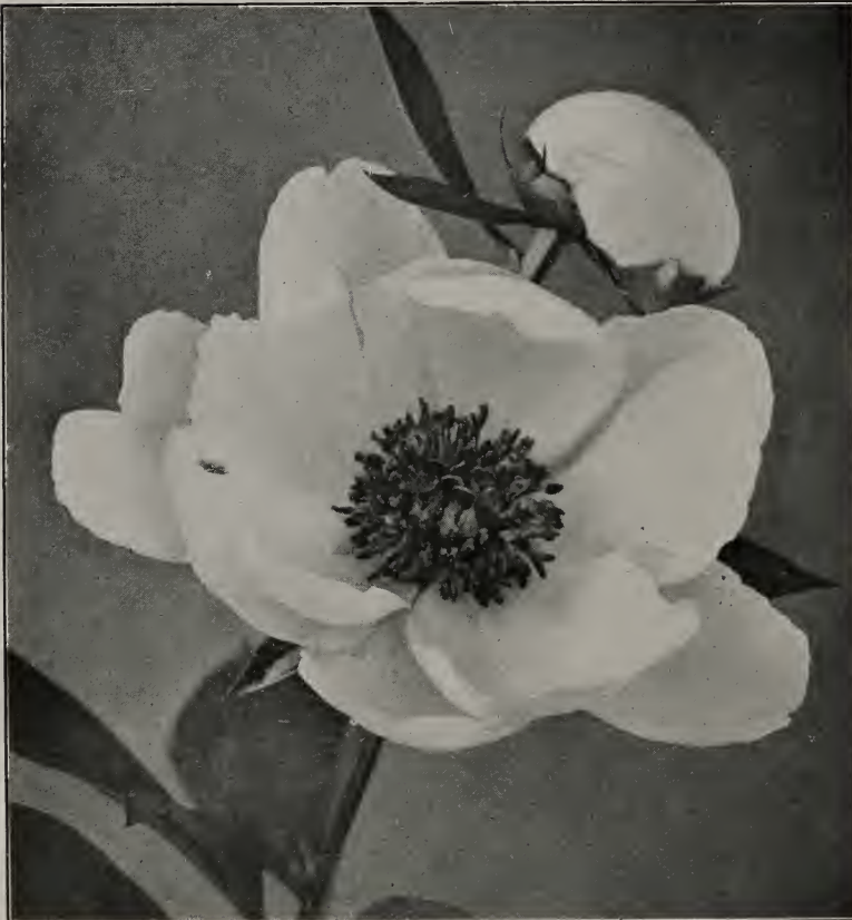
La Fiancee, Superb Single Peony Blooms early, but side buds keep it in bloom until late

Single. Those with a single row of wide guards, and a center of yellow pollen-bearing stamens. Semi-Double. Those with several rows of wide petals, and a center of stamens and partially transformed petaloids.